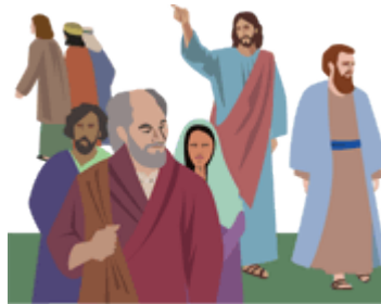
Jesus Sends Out His Disciples