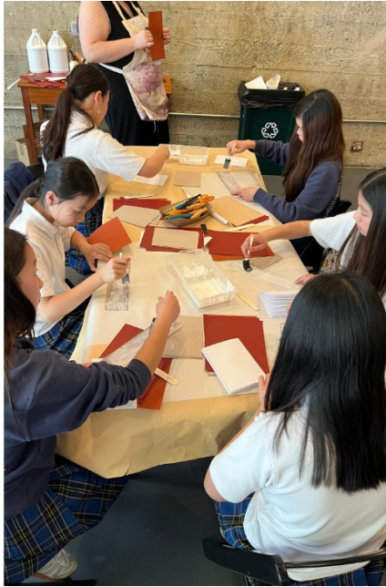
8th grade class visits the American Bookbinder Museum and sews their own book.