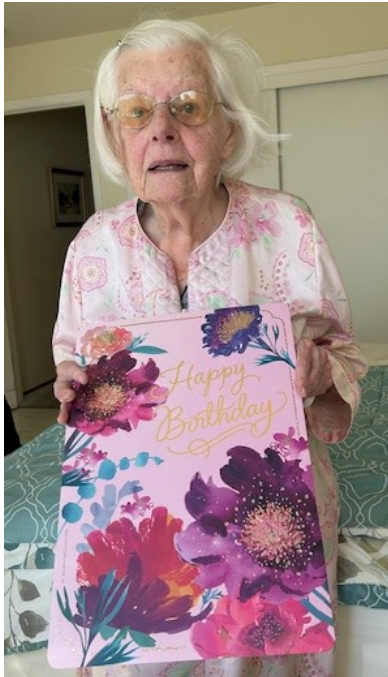
Large birthday card and her favorite cake - chocolate and strawberries.