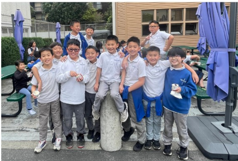
4th grade class celebrates a birthday