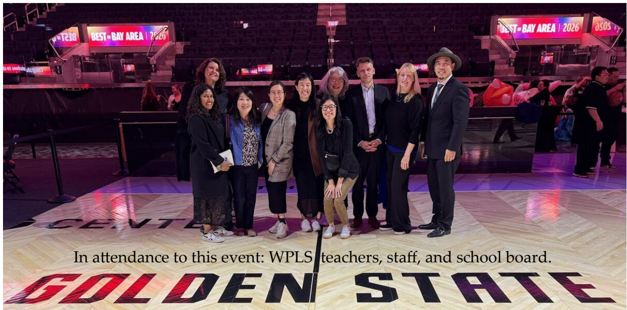
In attendance to this event: WPLS teachers, staff, and school board.

On our 75th Anniversary year, we are proud to continue to carry this distinguished title as we continue our commitment to educating and nurturing our students as a whole in a Christ-centered environment.